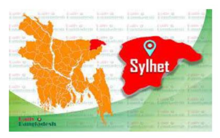
Figure 2: Research area in Bangladesh

The selected hospitals are very close to the researchers, which facilitates building a good relationship with service providers and respondents. The local dialect is also known to the researchers. Researchers coleected primary data form 45 respondents, including service providers (doctors) and service recievers (caesarian mothers) of two using purposive hospitals (Table 1), sampling method. Large number of respondents are not required for qualitative study, but it should be continued until data saturation (Fusch et al., 2015). The inability to attain data saturation has a negative influence on the overall quality and validity of the investigation. The researchers guaranteed data saturation to uncover the most relevant and critical perceptions of the respondents. Besides, purposive sampling is used to select information rich and unique cases in answering the study objectives (Creswell, 2017). If this method is seriously followed, a small sample may even become highly representative. Researchers framed a semi-structured (face to face interview guidelines-both open and close ended questionnaire) to enable respondents share their knowledge and practical experiences regarding this issue. The semi-structured interview method facilitates two-way conversation between the interviewer and the subject.