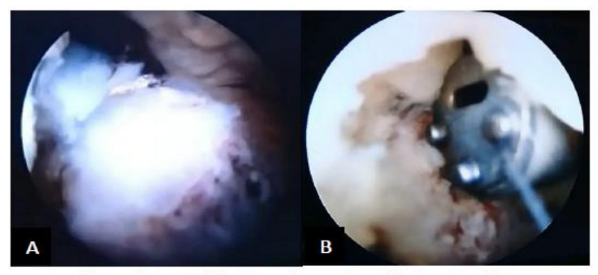
Figure 3: (A) visualization of the tumor, (B resection of the tumor with gaspar