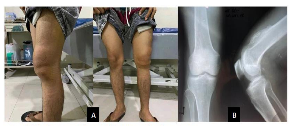
Figure 6: (A) clinical appearance of the patient, (B) xray genu AP/Lateral pre-operative