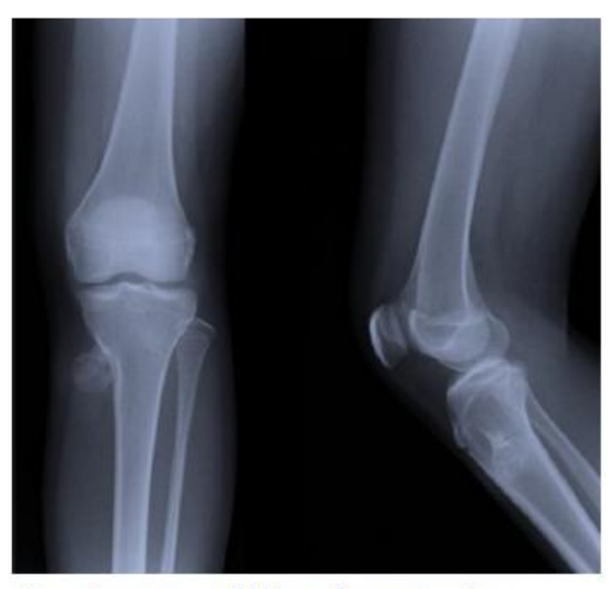
Figure 1: xraygenu AP/Lateral pre-operative

similar nick-and-spread technique was used at below the lesion for the instrumentation. With an osteotome, the osteochondroma was resected and removed with a grasper through the portal, and the remaining bony surface was abraded by a motorized shaver. Both portals were used interchangeably to ensure complete visualization and removal of the lesion. Histopathological examination confirmed the diagnosis of osteochondroma.