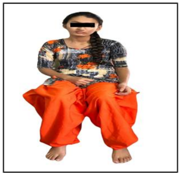
Fig-1 Patient with Takayasu arteritis and CV stroke

Here reported case is of 15 years old female suffering from Takayasu arteritis and CV stroke. She was relatively normal up to the age of 14 years of her age without any significant family history. She had complain of fever since last 4 months and sudden onset of weakness of left side of Upper and lower limb. As the time progressed, she started feeling difficulty in speaking. She had consulted neurophysician for the same and advised for CT scan and MRI. She was unconscious for 2 days and diagnosed having Takayasu arteritis and CV stroke.