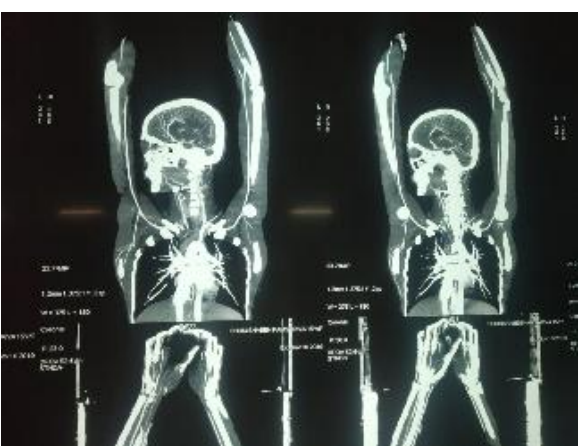
Fig-2 MR angiography of different views

Role of physiotherapy in management of Takayasu arteritis was important to prevent secondary