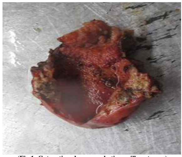
(Fig 1: Cut section shows exophytic papillary tumor)

Received a specimen of gall bladder which was grossly grey white, enlarged and showed extremely thickened wall measuring 1 cm in thickness. On cut section, the specimen revealed exophytic papillary tumour measuring 2.2 x 1.6 x 1.4 cm at the neck of the gall bladder (Fig 1). The rest of the GB mucosa was flattened.