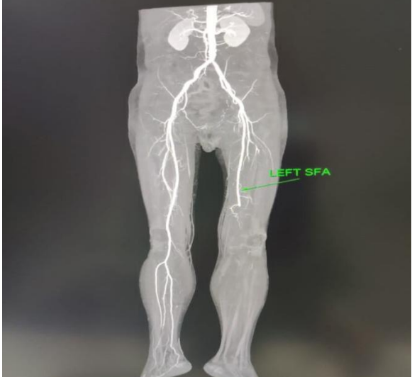
Fig 3 ARTERIAL OCCLUSION OF LOWER LIMB IN COVID 19: CT angiography showing occlusion of left superficial femoral artery 12cm above knee joint. E: Angiogram showing no flow in the distal left leg.

A 52-year-old male without any other co-morbid illness presented to the hospital with primary complaints of shortness of breath. His diagnosis of COVID-19 infection was made 1 day prior to the presentation. His initial symptoms were of fever, cough which started 5 days prior to the day of his COVID-19 diagnosis. On admission, he was afebrile, respiratory rate of 28 breaths per minute, saturation of 80 percent on room air. Patient was put on venturi mask after which the saturation became stable at 94%. Chest x-ray showed peripheral pulmonary opacities consolidations bilaterally (Fig1). Patient was started on low molecular weight