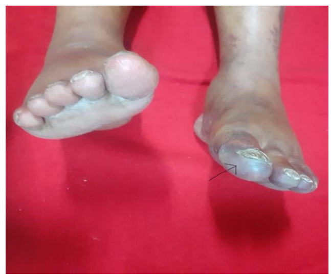
Fig2. Left foot showing bluish discoloration of the toes (arrow marked).