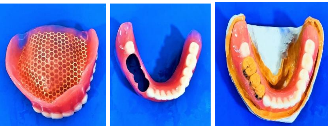
FIGURE 8: Upper Complete denture and lower cusil like denture.