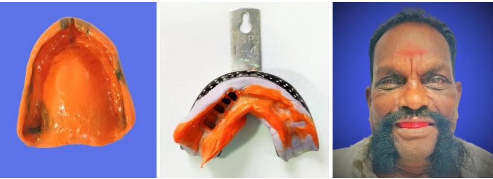
Figure 5 : Secondary impression