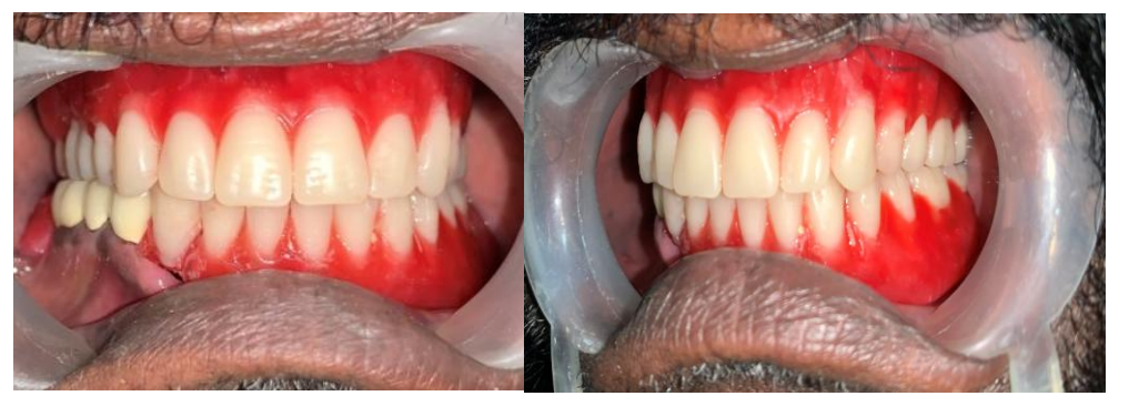
Figure 7:Try in of upper and lower teeth setting