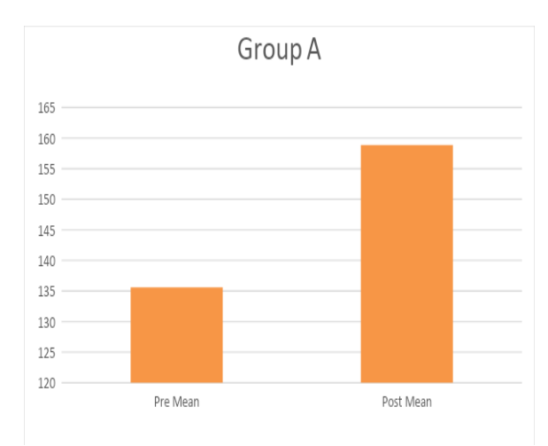
Graph 1: Representation of pre and post mean of mulligan (group {\bf A} )