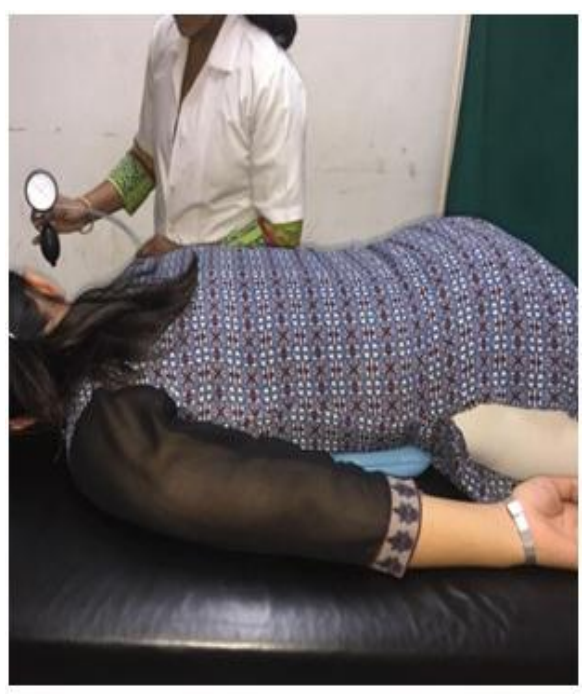
Figure.3: Core muscle activation with Pressure Biofeedback Unit

The abdominal draw in test will be performed with the subject in a prone lying position, and the Pressure Biofeedback Unit will be utilized to evaluate the ability of the subject to perform this abdominal isolation test. The Pressure Biofeedback Unit will be placed under the abdomen with the navel in the centre. 9,10 The Pressure Biofeedback Unit will then be inflated to 70 mmHg and will be allowed to stabilize, allowing for detection of fluctuations in pressure due to which breathing, mav approximately 2 mmHg for each inhalation and exhalation. Subjects will be instructed to perform an abdominal contraction. The instructions are given to breathe in and out and then, without breathing in, to slowly draw in the abdomen so that it lifts up off the pad, keeping the spinal position steady. 10,11 Deep inspiration is to be avoided. Then pressure change will be noted. The patient will be required to hold the contraction for 10 sec. The same procedure will be repeated for three times and pressure changes are noted and the average of the three repetitions will be used for analysis.