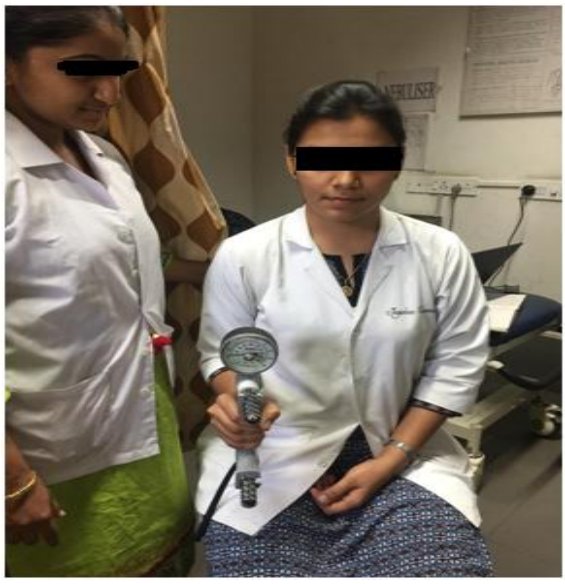
Figure. 1: Test position front view

was seated in a chair without armrests, with the feet resting entirely on the ground and the hip against the back of the chair. Shoulder adducted, elbow flexed at 90 degrees, forearm in neutral position, wrist between 0 -30 degrees of extension and 0degrees of ulnar deviation. 15 participants were instructed to hold the dynamometer and asked to use maximum force of hand squeeze around dynamometer. The test was done on Right limb and then the Left limb. Three trials were performed, with 15 seconds rest provided between each trial. Average of the three trials was taken as final reading.