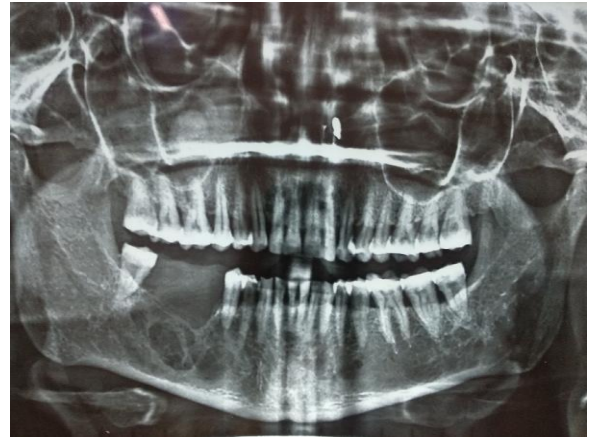
(Figure-3) Panoramic image showing a multilocular radiolucent lesion in molars areas.