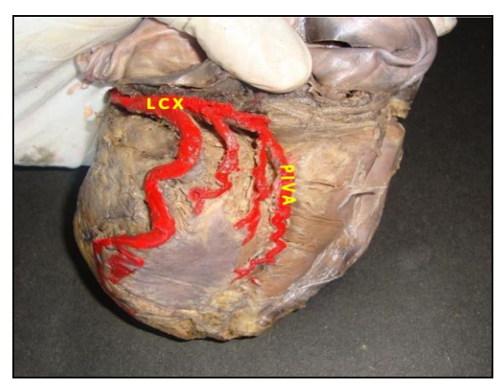
Fig 2 showing Left dominance - PIVA arises from circumflex artery

Right dominance: 26 hearts (52%) Left dominance: 10 hearts (20%) Co-dominance: 14 hearts (28%)