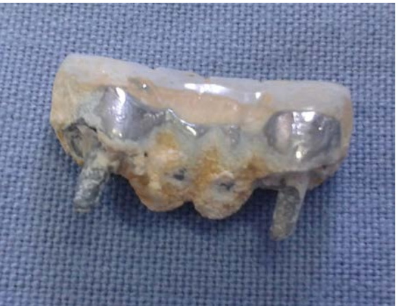
Fig3: note the accumulation of tartar and the too short length of the posts