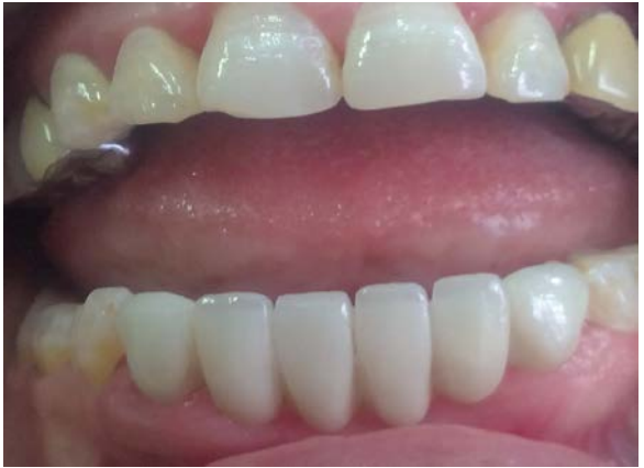
Fig.10: Final aesthetic result after adhesive cementation of the zirconia bridge