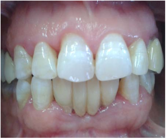
Fig1: Initial situation

The bridge presented degree 3 of mobility with pain felt at the slightest touch. Our course of action was first of all directed towards atraumatic removal of the bridge and evaluation of the residual support teeth.