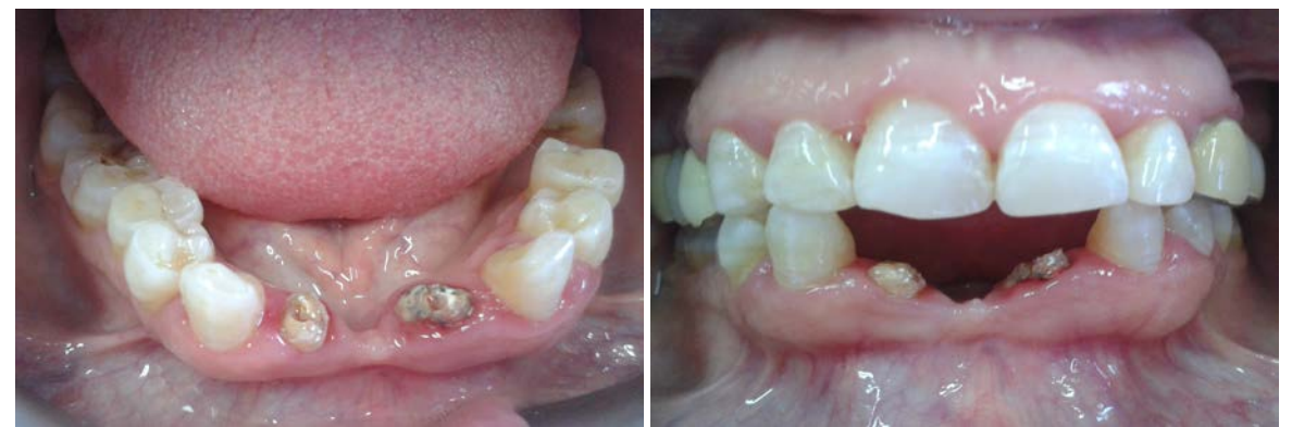
Fig. 4.a, b: Endo-oral view of the supporting teeth after removal of the old bridge

The condition of the dismantled bridge explained the increased mobility justified by a lack of retention due to the use of too short posts that did not sufficiently exploit the length of the roots. A deposit of tartar on the entire gingival surface of the pontic explained the inflammatory state of the edentulous ridge (fig. 3). The state of the residual supporting teeth justified their extraction: sub-total disrepair (fig. 4a, b), support periodontal reduced with а longitudinal fracture at the level of 32 (fig. 5). After comparing all the data, the prosthetic choice turned towards the creation of a ceramic-ceramic bridge with copings replacing zirconia the four mandibular incisors and taking 33 and 43 as supporting teeth. The clinical protocol began with the preparation of the supporting teeth (fig6.a, b). This preparation met the main principles of all-ceramic prostheses. Subsequently, a temporary prosthesis in baked resin was used to protect the prepared teeth.