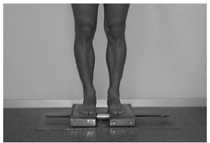
Measuring Intercondylar Distance to Assess Genu Varum