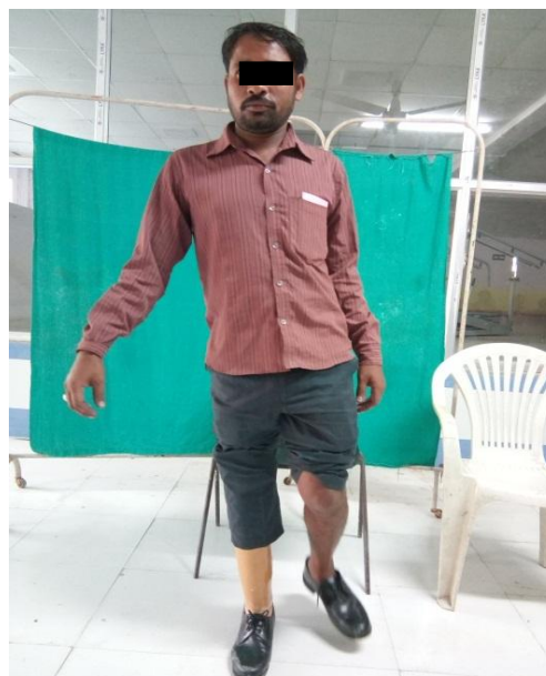
Fig 4: Standing on one foot