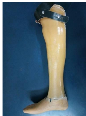
Fig 1: Transtibial prosthesis with solid ankle foot with rubberized cushion