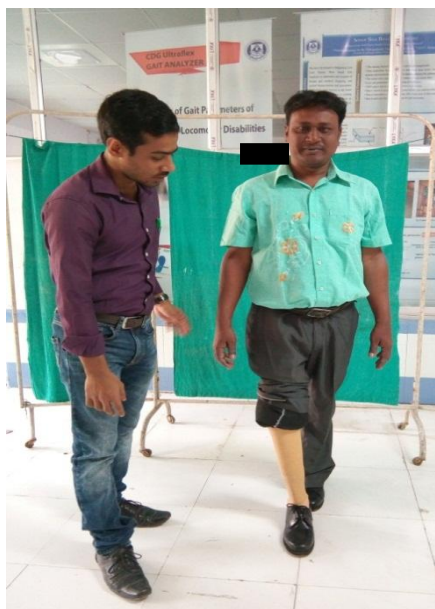
Fig 3: Standing with one foot in front