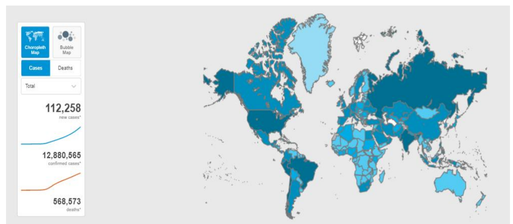
Figure 1: Globally, total number of confirmed cases of COVID-19 are 12,880,565 including 568,573 deaths.

India has witnessed a rapidly exploding pandemic of COVID-19 with first confirmed case was reported in the state of Kerala on 30 January 2020 followed by new cases in New Delhi, Mumbai, Bengaluru, Hyderabad, and Patna. According to the press report by the Indian Council of Medical Research (ICMR) on July 13, 2020, over 1.1 crore samples has been tested for COVID-19 in collaboration with the facilities of government and private laboratories. The current scenario of coronavirus among all state of India is depicted in figure 2 which show the distribution of positive cases along with recovery rate until May 27, 2020 and the cases until May 8, 2020 have been shown on an geographical map of India in figure 3 (Kumar SU et al, 2020). COVID-19 affecting the population in different ways some shows symptomatic whereas other have asymptomatic behaviour. The symptoms of COVID-19 include fever, cough, respiratory symptoms, shortness of breath, breathing difficulties, fatigue and a sore throat. According to WHO, older people and those suffering with chronic diseases such as hypertension, diabetes, cancer are prone to develop coronavirus with severe symptoms and therefore need medical intensive care.