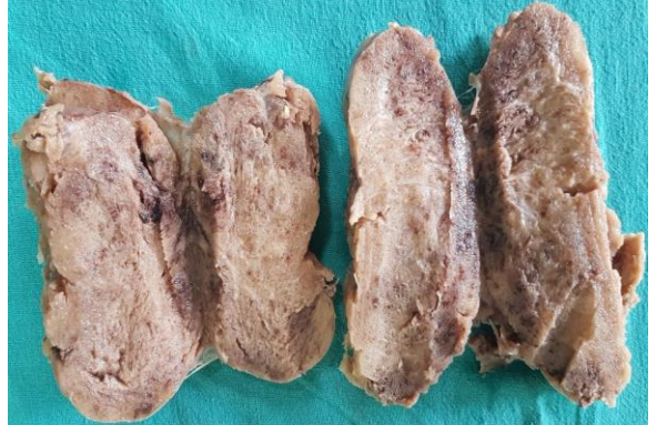
Figure 2: Gross photograph of thyroidectomy specimen showing both right and left lobes with tan brown microcystic change on the cut surface

performed. We received thyroidectomy specimen weighing 550gm, comprising of right and left lobe of thyroid measuring 12x7x5 cm and 10x6x6 cm respectively with attached isthmus. The external surface was encapsulated, nodular and the cut surface was tan brown with microcystic change (Figure-2).