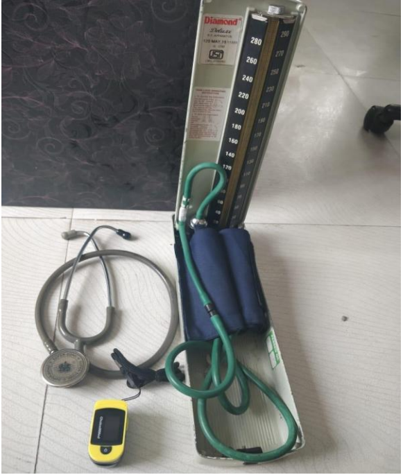
Fig. 2: Apparatus used in the study.