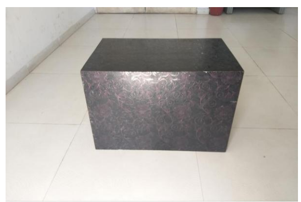
Fig. 1: Queen's college step stool of 16.25 inches (41.3cm) height

metronome, weighing machine, sphygmomanometer, pulse oximeter, chair, pen and paper.