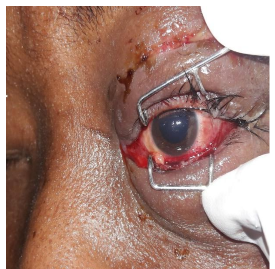
Figure 2: Mid-dilated nonreactive pupil, conjunctival chemosis