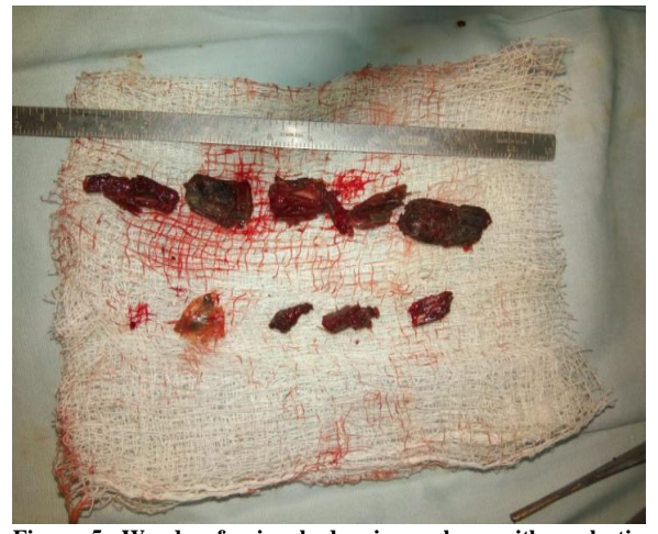
Figure 5: Wooden foreign body pieces along with a plastic piece