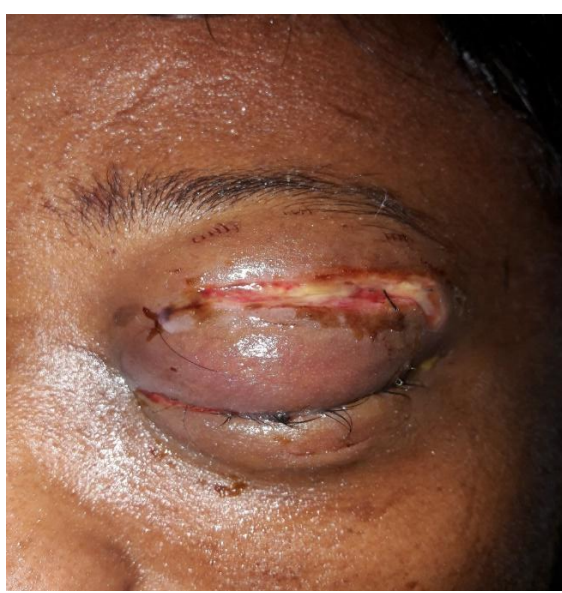
Figure 1: Laceration over eyelid with discharge