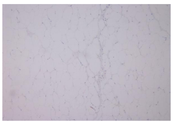
Fig 5 :Immunohistochemistry showing negative MDM2