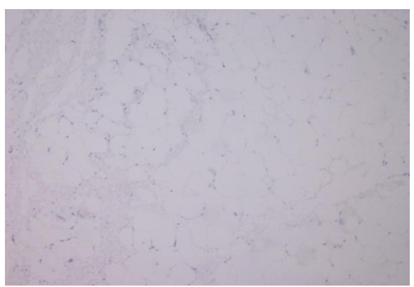
Fig 4: Immunohistochemistry showing negative CDK2.