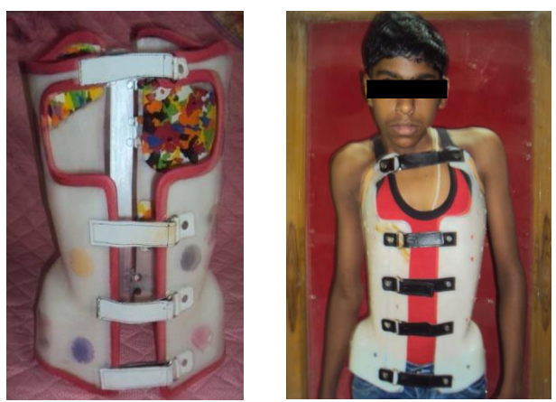
Fig - 2(a) shows the front view of the complete brace with Push pads and Stops pad to prevent the progression of curve. Fig - 2(b) shows the symmetric force control brace with the subject.

The x-ray examinations were quantified by measuring Cobb angle before the intervention, just after the intervention and after the adaptation period of 12 weeks. The postural deviation was measured by using plumb line from the middle point of occipital protuberance and St. George's respiratory questionnaire (SGRQ)<sup>[9]</sup> to identify the respiratory problem.