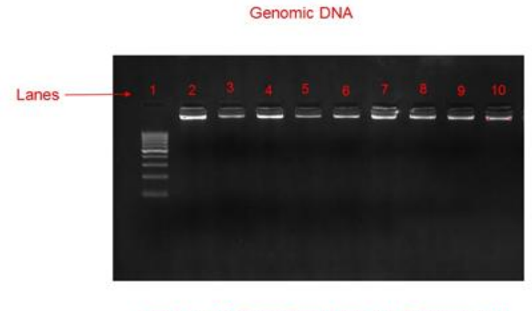
Lane 1 100 bp ladder and lanes 2-10 genomic DNA

Further analysis carried out on positive samples from microscopy using PCR to indicate presence of trypanosomes in blood sample from selected abattoirs. Lane 1 shows the 100bp DNA marker while lanes 2-10 indicates the presence of both parasites showing the genomic DNA as seen in Plate 1.