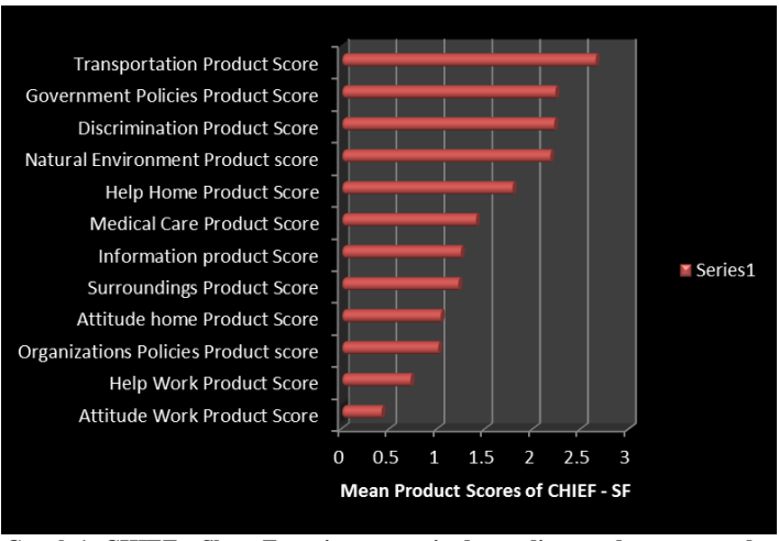
Graph 1: CHIEF - Short Form item score in descending product score order

* Correlation is significant at the 0.05 level (2-tailed). CHART: Craig Handicap Assessment and Reporting Technique