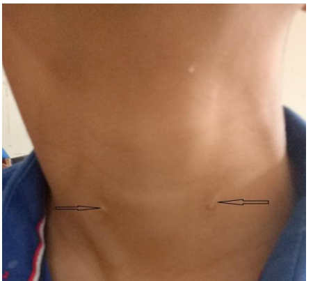
Fig.1 pre-op picture showing bilateral Fistulous opening