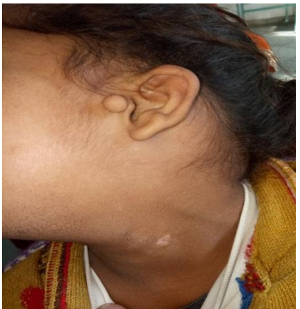
Fig.8 lt. ear preauricular tag