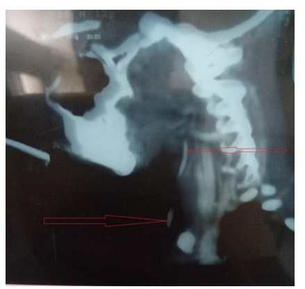
Fig.2 CT fistulogram showing fistulous track

Second case is a female child of 6yrs with history of fistulous opening in neck