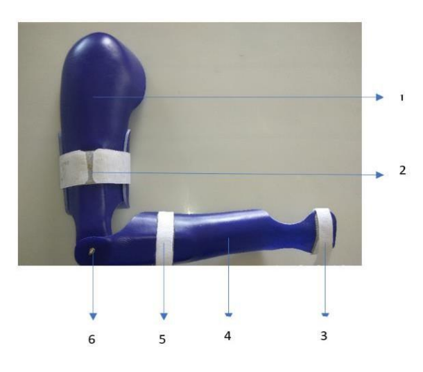
Figure 1: New humeral functional fracture brace

{Parts of the fracture brace are Arm shell1, Straps (arm shell)2, Straps (over the wrist)3, Forearm shell4, Straps (over the forearm)5, Elbow joint 6}