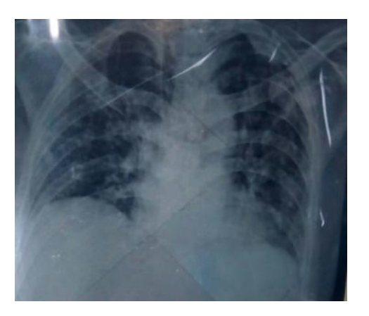
Figure 1: AP view chest x-ray (26/6/20) Bilateral patchy consolidation Rt > Lt Figure 2:PA view chest x-ray (29/7/20) Bilateral minimal patchy infiltrates indicative of resolving ARDS